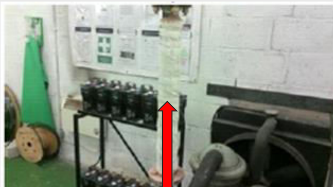
Wrap to exhaust