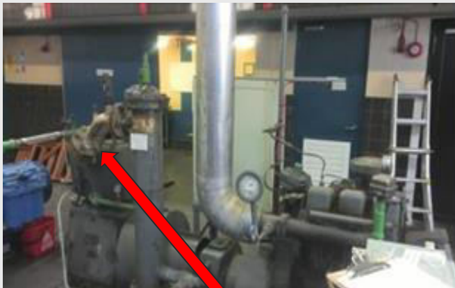
Flange joint gaskets