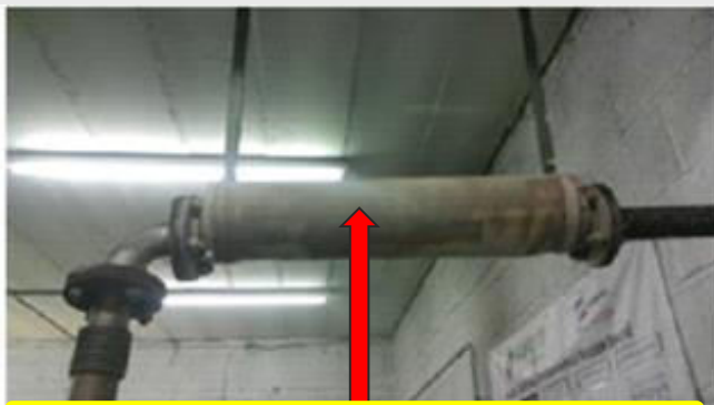
Paper lining under non-asbestos insulation